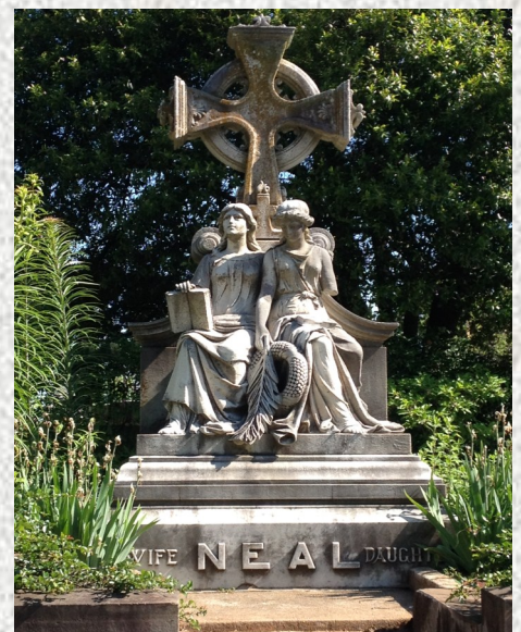
The Neal family monument features numerous symbols, including open and closed books, wreath and palm frond.

Many thanks to Oakland Cemetery staff who helped us plan the tour, and those who met with us that day. Thanks also to those who attended and contributed to an enjoyable and educational day.