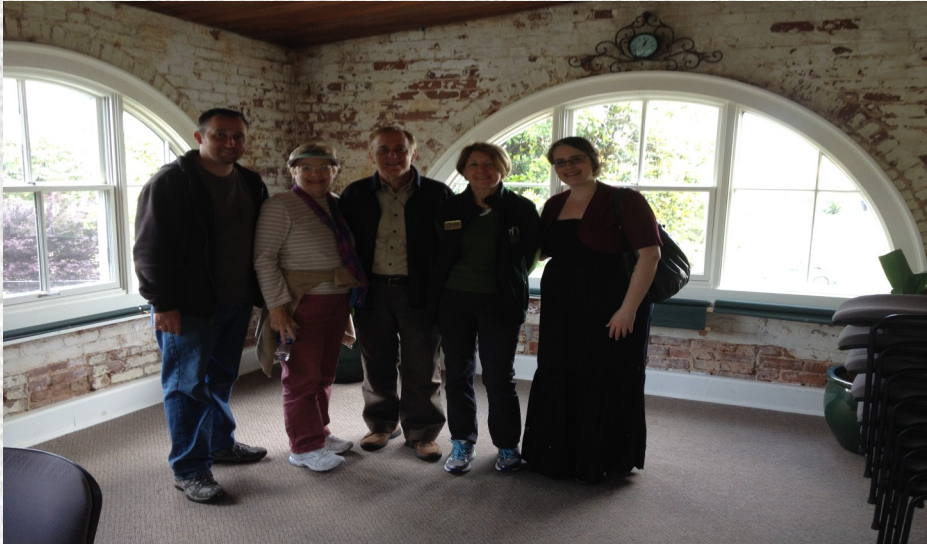
Tour attendees with Oakland Cemetery staff.

On May 16, several SGA members enjoyed a tour of Atlanta's Oakland Cemetery. Our visit included a 90 minute tour of the cemetery grounds, as well as a demonstration of gravestone restoration, and a peek inside the Cemetery's archives.