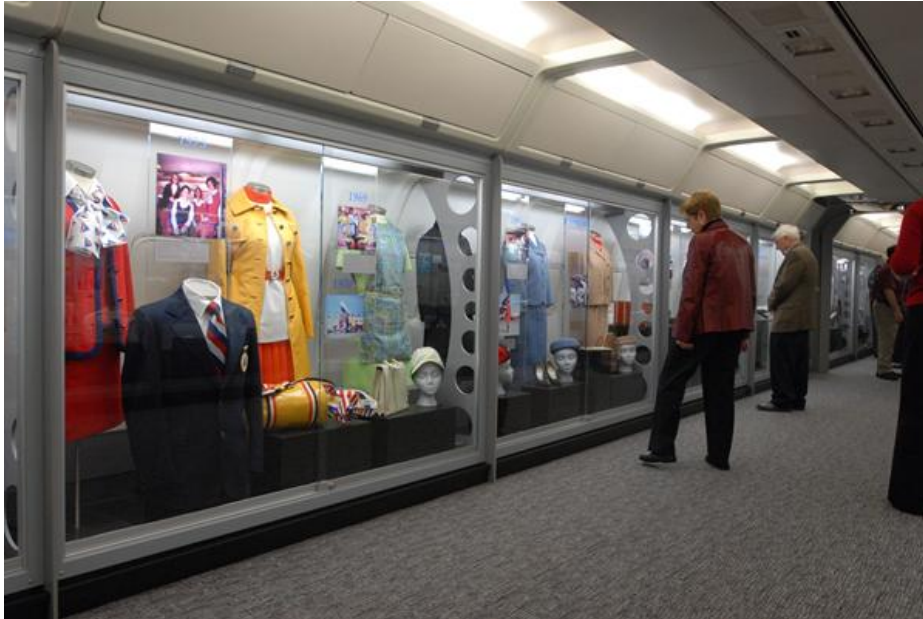
The Spirit of Delta exhibit inside a Boeing 767.

Current exhibits at the museum include the award-winning The Spirit of Delta , opened in 2006 inside Delta's first Boeing 767, purchased by Delta employees in 1982. The exhibit fills the cabin with colorful "Jet Age" advertising, uniforms, china, and aircraft models dating from 1959. Delta Takes Off! From Crop Dusting to Jets explores Delta's history as the world's first crop-dusting company in 1924 to its first jet in 1959. Through the exhibit Red Tail Flying: Voices and Images of Northwest Airlines , visitors can learn about Northwest Airlines from its pioneering days as a mail carrier in 1926 to its 2008 merger with Delta through photographs, advertisements, artifacts, commercials, and employee stories.