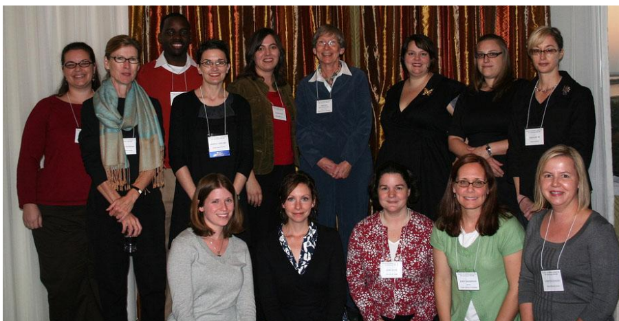
SGA's 2009 Board Members at the Annual Meeting in November.