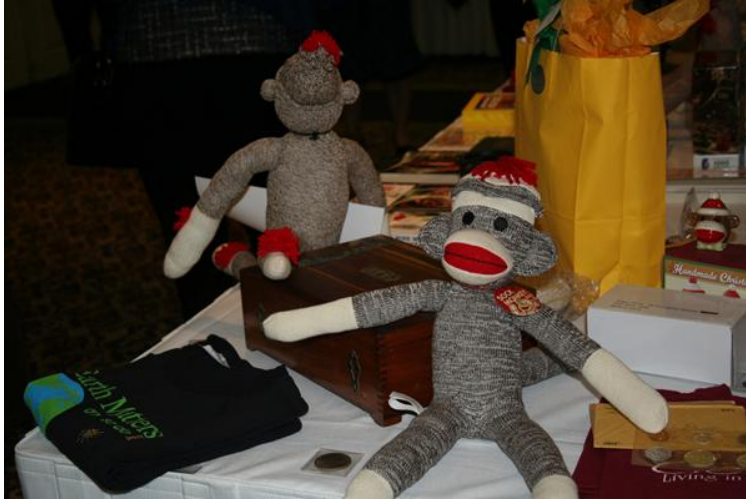
Sock Monkeys on the auction table at the 2009 SGA annual meeting.

Regarded as high demand auction items, these simians form part of the key anticipated fundraising event for SGA. Each year rumors begin to circulate about the sock monkey up for bidding and the bidding for sock monkeys becomes increasingly competitive. Sock monkeys account for nearly seven thousand dollars in funds since 2001 and 40% of the total monies raised.