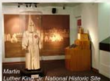
Martin Luther King, Jr. National Historic Site