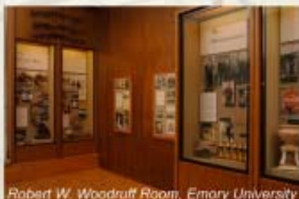
Robert W. Woodruff Room, Emory University