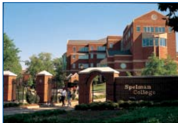
This year's SGA Annual Meeting will be held at Spelman College in Atlanta, November 1-3, 2006

The scholarship will cover the following year's membership dues, the meeting registration fee, and a maximum of $100 for other expenses. The registration fee for the successful scholarship applicant will be waived by the Society of Georgia Archivists, while other expense will be reimbursed upon submission of a statement of expenses, with accompanying receipts, by December 1 of the calendar year in which the meeting takes place.