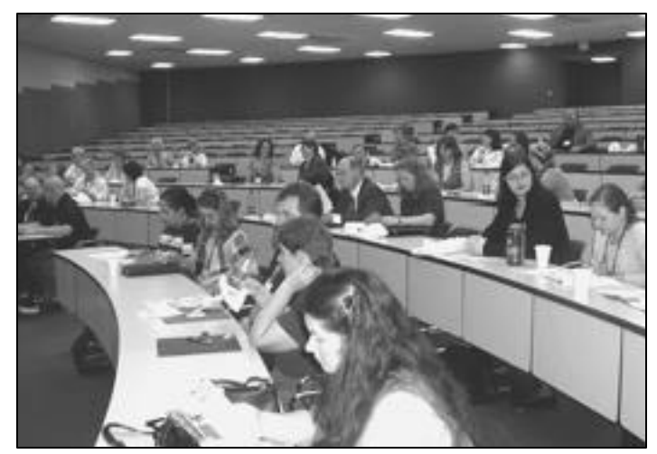
SGA members gather for keynote address