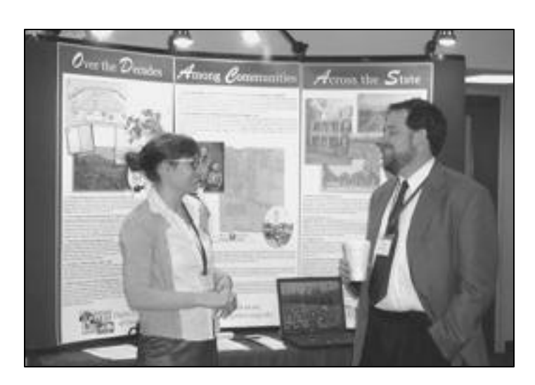
Digital Library of Georgia exhibit