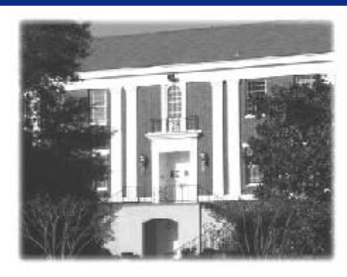
Willet Memorial Library.

Because the archives chronicle the history of Wesleyan, major collections include official papers of the college. These collections include items of historical interest to the college, such as photographs, diplomas, essay, books, faculty publications, programs, and clothing.