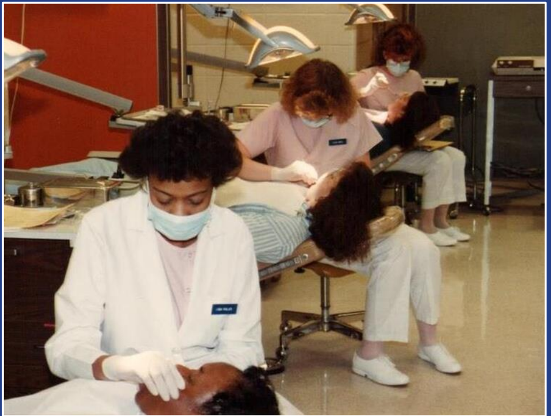
Clayton State dental hygiene students earn clinical hours serving patients at the free dental clinic on campus.