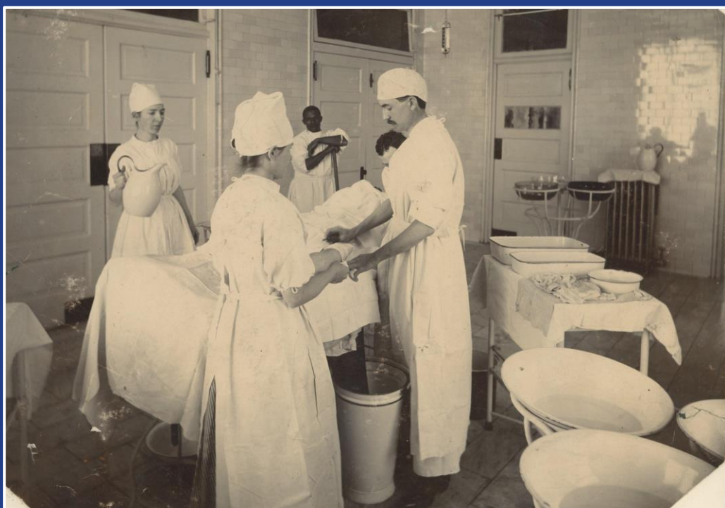
Saint Joseph Infirmary, staffed by Sisters of Mercy.