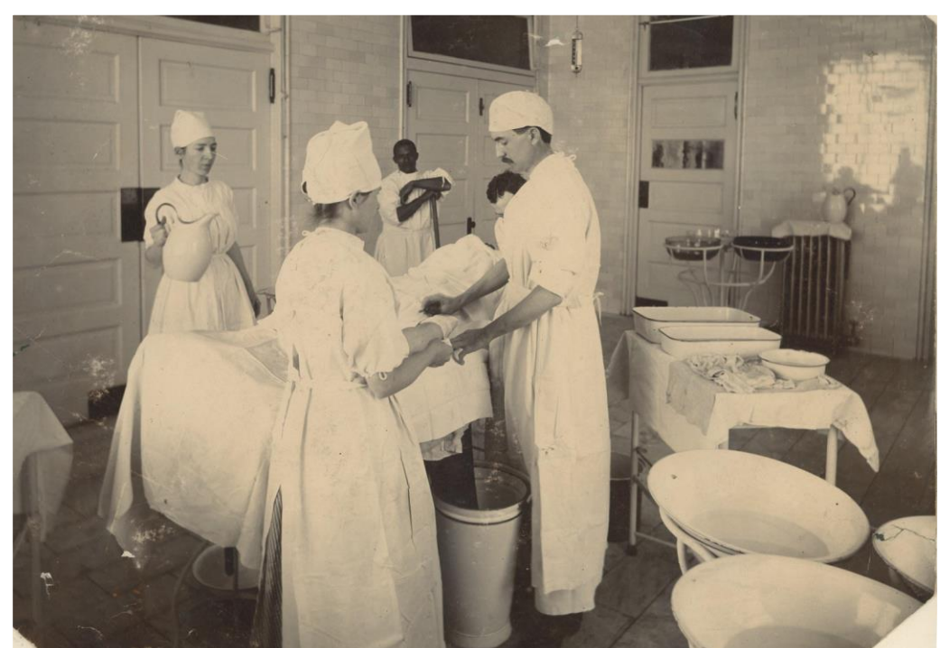
Saint Joseph Infirmary, staffed by Sisters of Mercy.