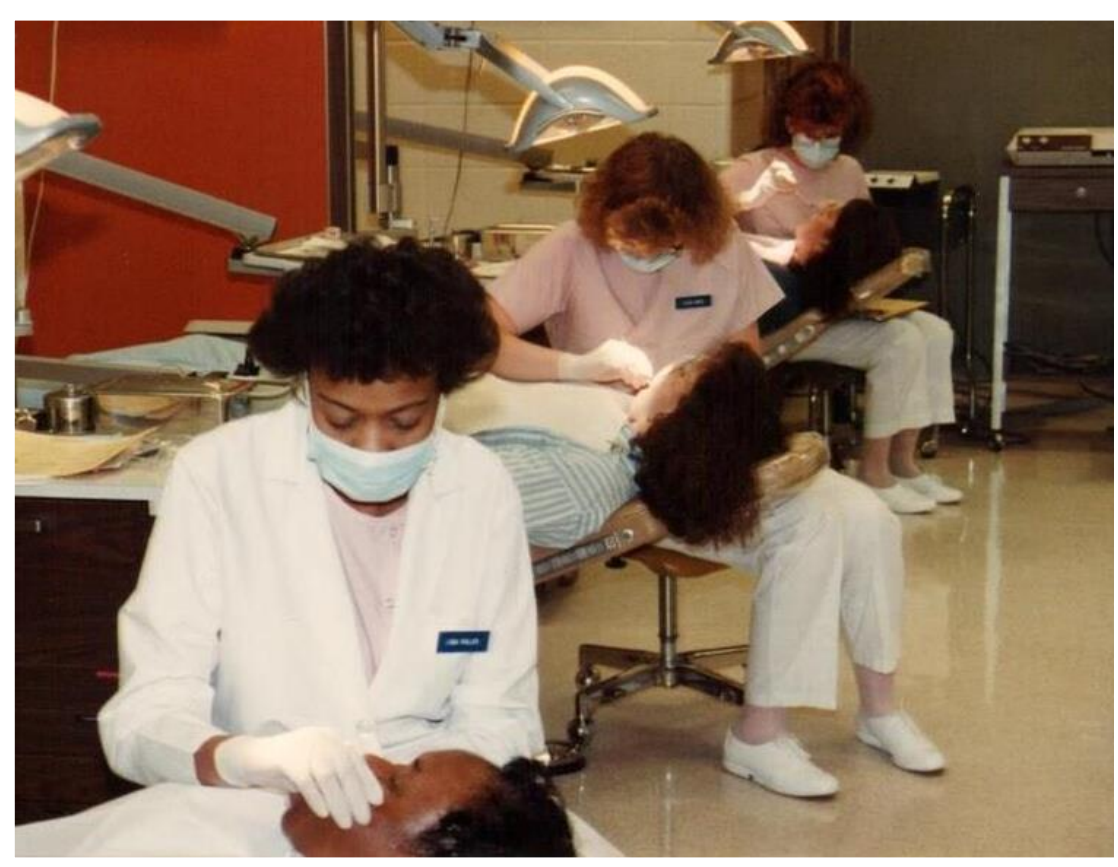
Clayton State dental hygiene students earn clinical hours serving patients at the free dental clinic on campus.